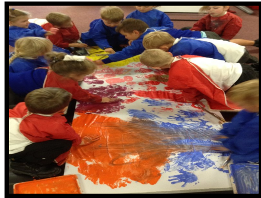
Exploring colour and texture