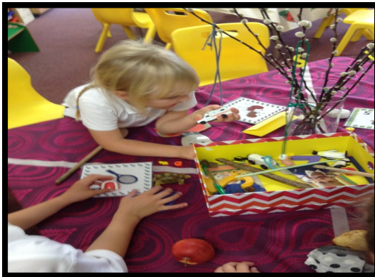
Investigating letter sounds

Here are a few pictures to show what we have been up to.