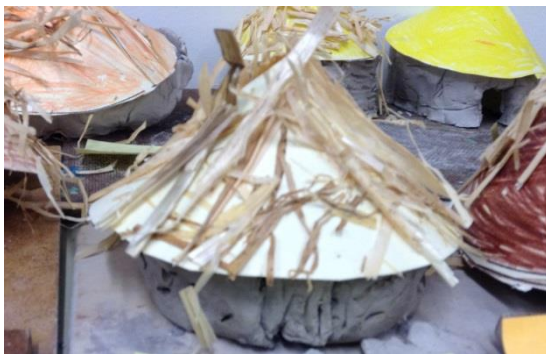
Bronze Age Round House

Can you demonstrate your coding skills to someone at home?