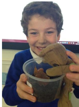
Groot investigating soil!