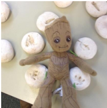
Groot with the fossils!

This term we have enjoyed learning about the Bronze and Iron Ages, including making our Bronze Age houses. We have also loved finishing reading 'Stig' and meeting 'UG! Excellent investigative work has been explored during our forces topic. Which forces can you remember?