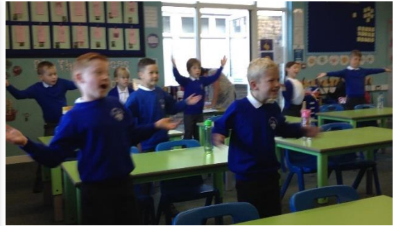
Dancing to "That's what makes you Beautiful".

Maple Class have settled really well back into the routine of being at school this term. They have come into the classroom with big smiles on their faces and enjoyed starting the day with some dancing at their desks! 😊