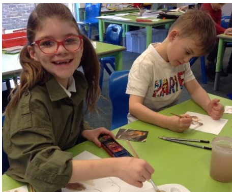
Enjoying painting during our Art Day.