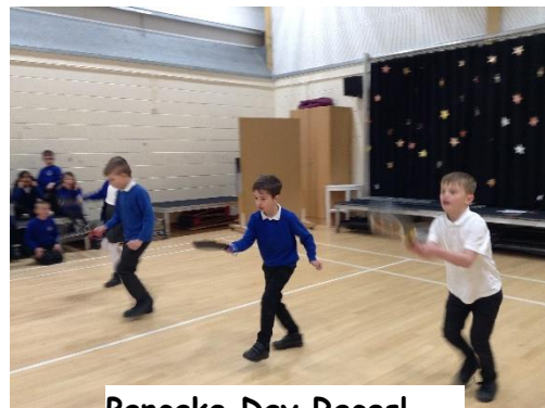
Pancake Day Races!